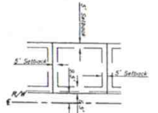
TYPICAL LOT SETBACK